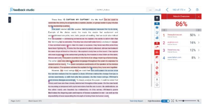
Figure 1. Mosaic Plagiarism or Patchwriting Example

As shown in Table 1, Mosaic Plagiarism is the most prevalent type of plagiarism committed by Language students. The presented data indicate that many students combine excerpts from various sources while producing their output, substituting original words with synonyms and preserving the original structure and meaning of the text without appropriately acknowledging the sources. Based on the high determined percentage of Mosaic Plagiarism or Patchwork, it can be inferred that this type of plagiarism is relatively easy to commit; this is likely due to the difficulty of keeping track of multiple sources and pieces of information, which can make it tempting for students to take this shortcut.