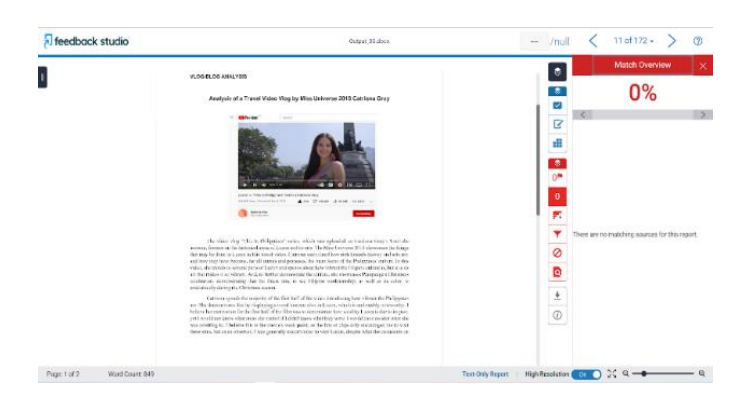
Figure 6. Example of No Plagiarism Found

Additionally, out of the 172 outputs reviewed, 38 of them, almost 23%, did not indicate any plagiarism according to the Turnitin software (see Figure 6). This may suggest that these 38 students properly paraphrased the information and cited their sources correctly. To verify the absence of plagiarism, the researchers thoroughly examine the 38 outputs that were not flagged and decide based on their assessment of whether plagiarism has occurred or not.