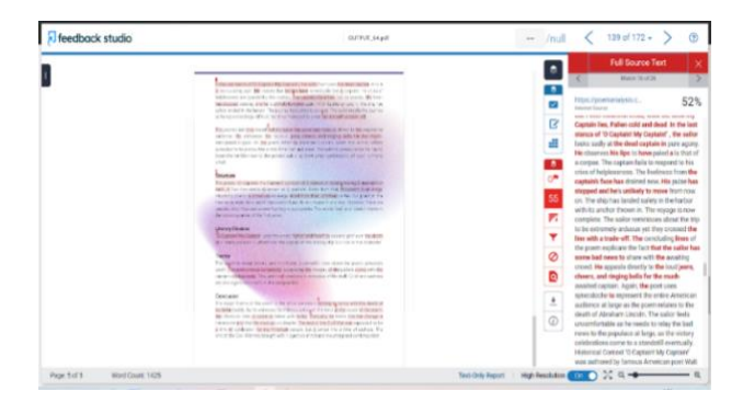
Figure 5. Structural Plagiarism Example

The word order, rephrased sentences, modified words, and sentence structure were all elements that the researchers thoroughly checked in this case before classifying it as structural plagiarism. Alvi, Stevenson, and Clough (2021) supported this analysis and stated that some of the frequent paraphrasing tactics utilized by plagiarists had been recognized as a synonymous replacement, word reordering and insertion/deletion.