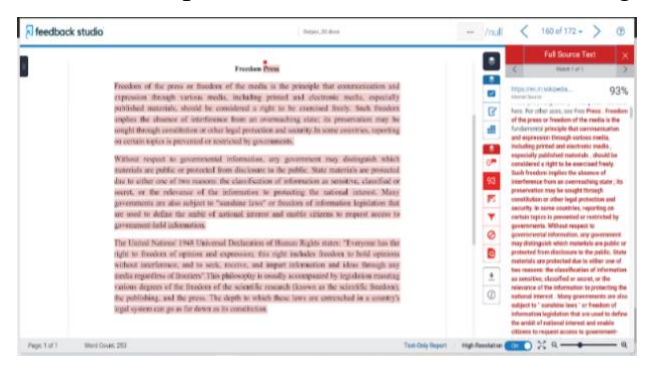
Figure 2. Verbatim Plagiarism Example

Figure 2 shows that the student had directly copied (word-for-word) several paragraphs from the internet source. The student provides no citation or acknowledgment of the source.