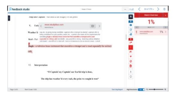
Figure 5. Unintentional Plagiarism Example